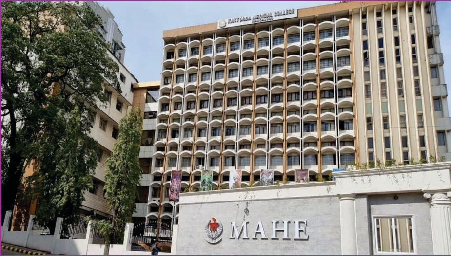
Kasturba Medical College, Mangalore