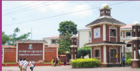
Yenepoya Medical College