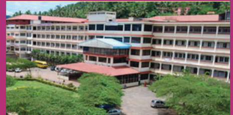
K.V.G. Medical College