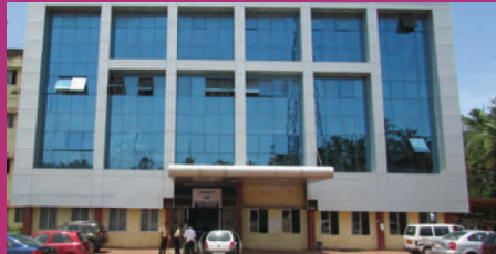
Srinivas Institute of Medical Sciences