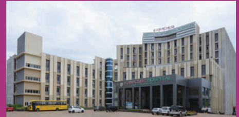
Kanachur Institute of Medical Sciences