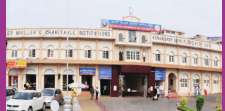
Father Muller Medical College