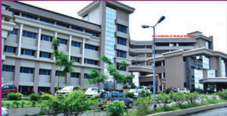
AJ Institute of Medical Sciences