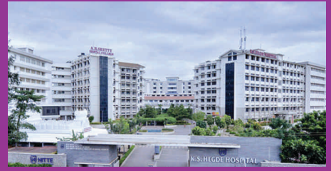
KS Hegde Medical Academy