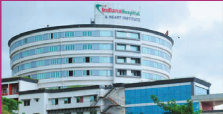
Indiana Hospital & Heart Institute